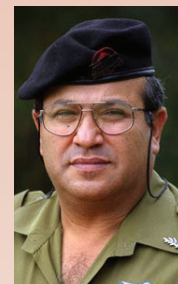
Meir Dagan, Director

Mossad's tenth, and current Director since 2002, is 65-year old Meir Dagan, a retired 30-year battle-hardened IDF commander and son of Holocaust survivors. He was born on a train between Russia and Poland and speaks several languages.